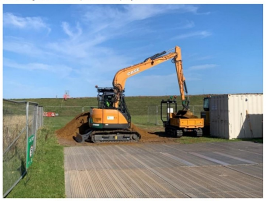
Photograph above: Site compound being set up at Wells

During October, the North Norfolk field team completed a project to improve a section of the embankment crest at Wells East Bank. The flood defence embankment at Wells runs coincidental to a public footpath and is used frequently by dog walkers and ramblers visiting the coast. The high level of pedestrian use caused the surface to become worn and muddy during the winter months and created a hazard for our field teams when inspecting and accessing structures along the bank. The scheme was designed to restore the crest by importing Carstone to provide a stable path and prevent further disruption to the surface. 250m of new surfacing was laid as part of this project.