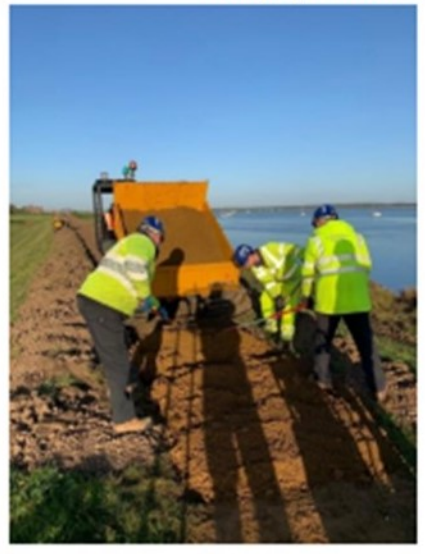
Photograph above: Operatives compacting the Carstone